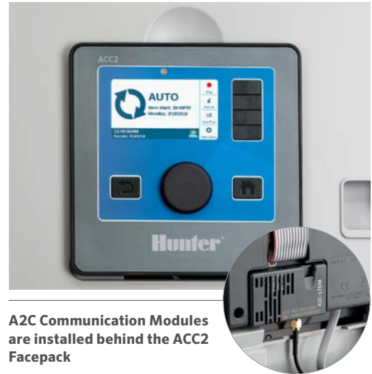
A2C Communication Modules are installed behind the ACC2 Facepack