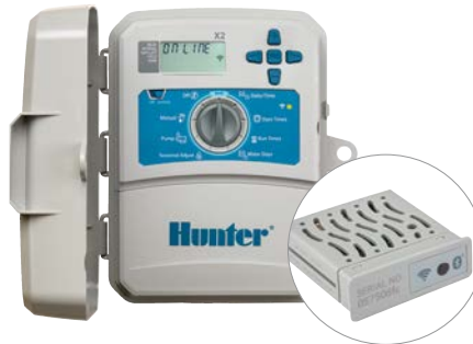
X2 Controller with WAND Module 4-, 6-, 8-, and 14-station count