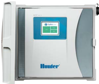
HCC Controller 8- to 54-station count, EZDS two-wire option