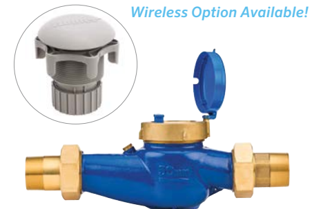
HC Flow Meter Add an optional flow meter to receive flow alerts and monitor water consumption Not available for X2