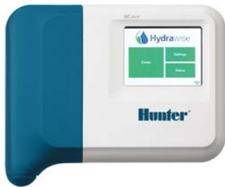
HC Controller 6- and 12-station count

Access to Hydrawise Software is free for all users worldwide. To learn more, visit hydrawise.com .