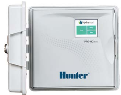
Pro-HC Controller 6-, 12-, and 24-station count