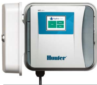
HPC Controller 4- to 32-station count, EZDS two-wire option