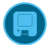
PXSUNC Accessory Visit fxl.com