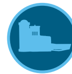
Solar Sync Sensor