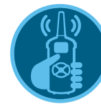
ROAM Remote ROAM XL Remote